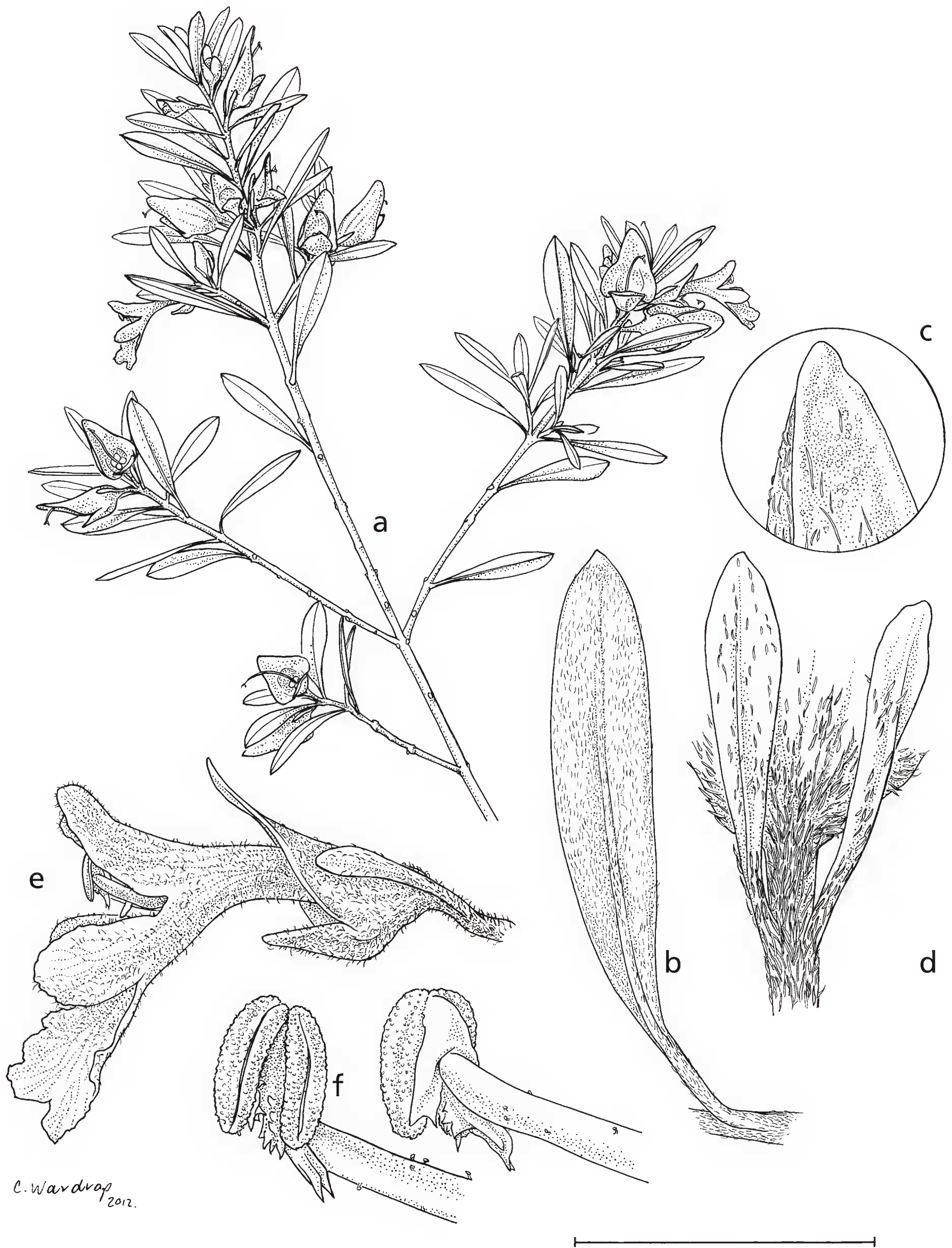
Figure 3. Prostanthera mulliganensis . a , habit, showing flowering branchlet with flowers and developing fruits; b , leaf, abaxial surface showing antrorse hairs; c , detail of apex of leaf, mostly showing adaxial surface; d , prophylls and base of calyx; e , lateral view of flower showing prophylls, calyx, corolla and partial view of stamens; f , stamens showing ventral (left) and dorsal view of anther locules, connective appendages, and staminal filaments ( J.R. Clarkson 5838 ). Scale bar: a = 5 cm; b , e = 1.2 cm; c , d , f = 0.3 cm; g = 0.4 cm.